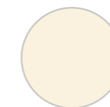
Cream Flat/Matt RAL 9001