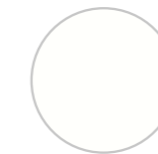
Signal White Flat/Matt RAL 9003