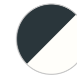
Anthracite Grey/Signal White Flat/Matt RAL 7016 / 9003